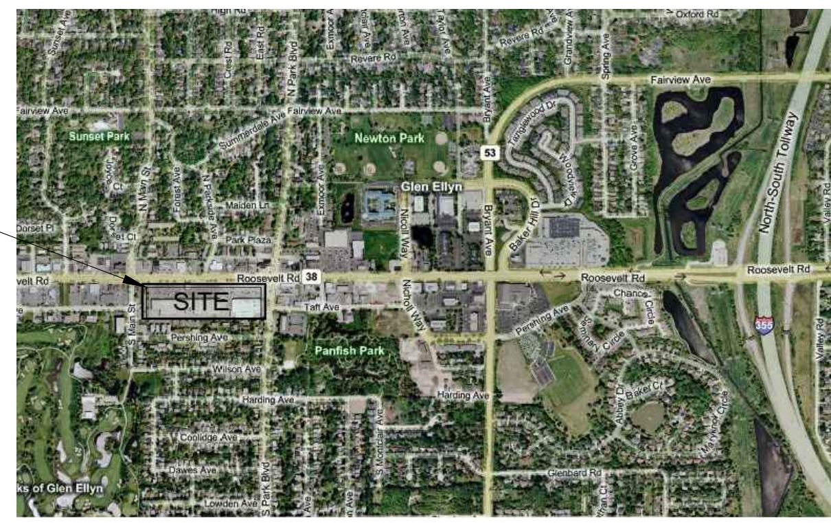
LOCATION MAP N.T.S. NORTH

Dates: November 6, 2009 March 10, 2010 May 6, 2010 November 17, 2010 March 29, 2011 November 16, 2011 February 22, 2012 May 2, 2012 May 3, 2012 May 31, 2012 July 16, 2012 September 26, 2012 March 19, 2013 June 7, 2013 October 9, 2013 October 15, 2013 October 22, 2013 January 15, 2014 February 18, 2014 May 2, 2014 August 8, 2014 September 9, 2014 September 25, 2014 April 17, 2015 June 23, 2015 August 11, 2015 August 14, 2015 November 19, 2015 December 1, 2015 March 18, 2016 April 19, 2016 June 15, 2016 October 25, 2016 December 12, 2016 March 24, 2017 April 20, 2017 May 02, 2017 June 08, 2017 April 02, 2018 April 16, 2018