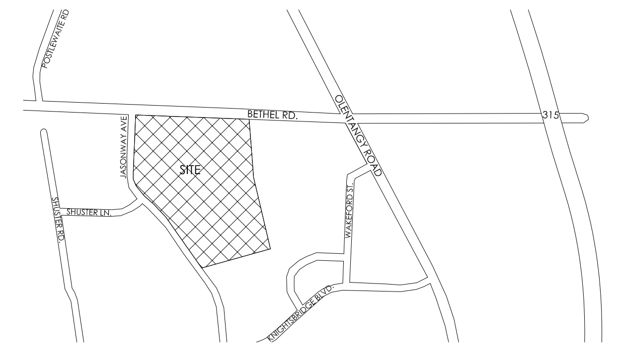
LOCATION MAP N.T.S.