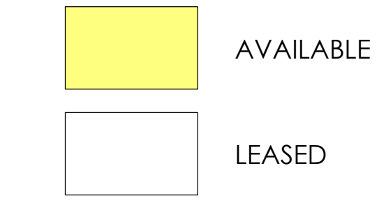
LEASE/SITE PLAN SCALE: 1"=60'-0"